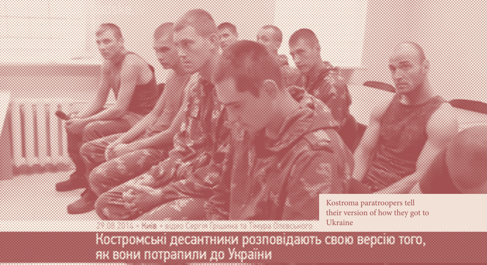
Kostroma paratroopers tell their version of how they got to Ukraine

Костромські десантники розповідають свою версію того, як вони потрапили до України