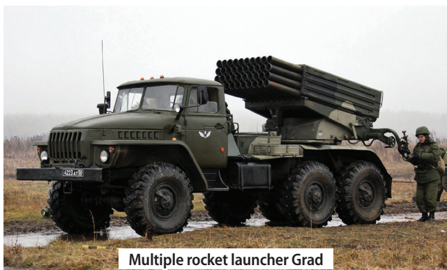
Multiple rocket launcher Grad

In 2014, artillery attacks were carried out by units of the so-called «ASouth-Eastern Army», namely «Ghost», «Cossacks» and Dryomov's unit. They were using multiple rocket launchers Grad.