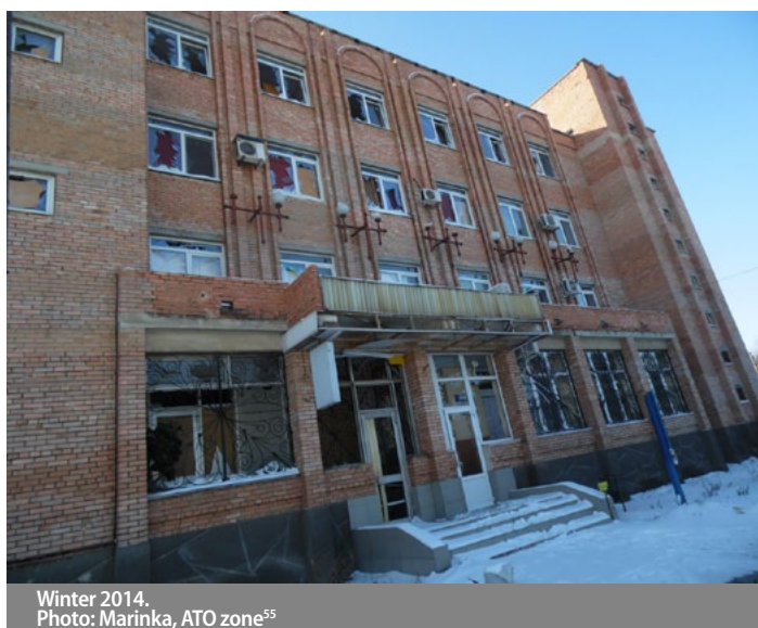
Winter 2014. Photo: Marinka, ATO zone 55

According to official data, 41 town dwellers including 2 children perished during the military conflict in Marinka. 57 blocks of flats and 652 private houses were destroyed or partially damaged 63 . Notwithstanding such range of destruction, the population of this unconquerable town lives in the hope that its infrastructure, administrative and private buildings will be renewed. And having their own bitter experience, they wish peace to the whole Ukraine.