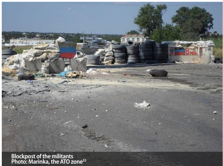
Blockpost of the militants Photo: Marinka, the ATO zone 33