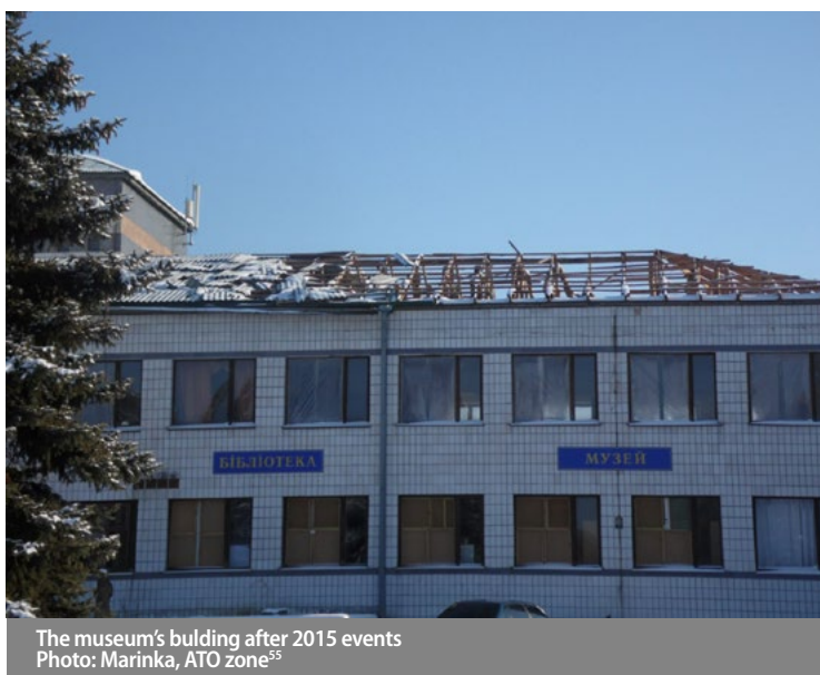
The museum's building after 2015 events Photo: Marinka, ATO zone 55

The most difficult was the winter season of 2014 – 2015. Shelling did not cease, water, gas and