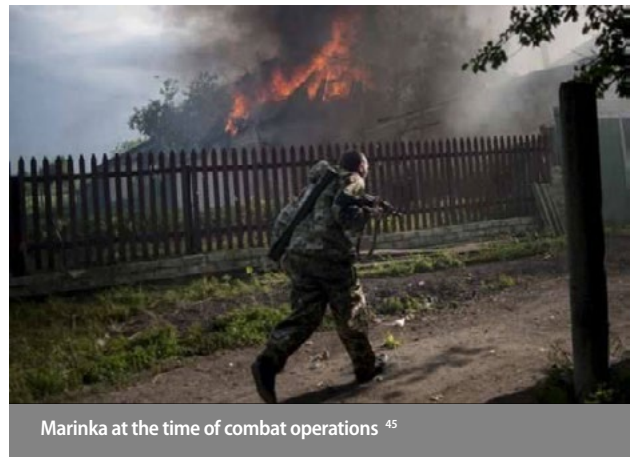
Marinka at the time of combat operations 45

The combat that continued from June 3 to June 5, 2015 became one of the biggest mili- tary actions conducted in Marinka.