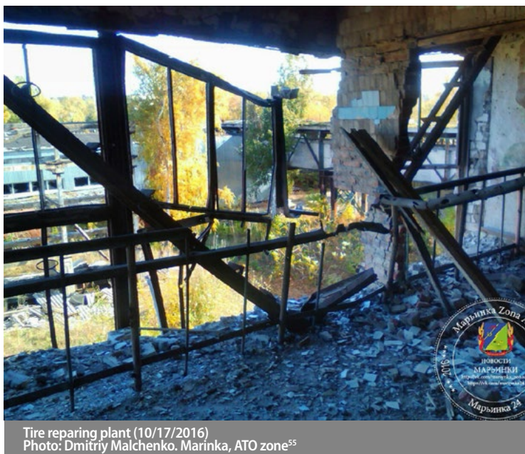
Tire repairing plant (10/17/2016) Photo: Dmitriy Malchenko. Marinka, ATO zone 55