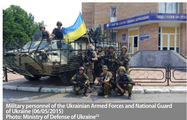
Military personnel of the Ukrainian Armed Forces and National Guard of Ukraine (06/05/2015) 52