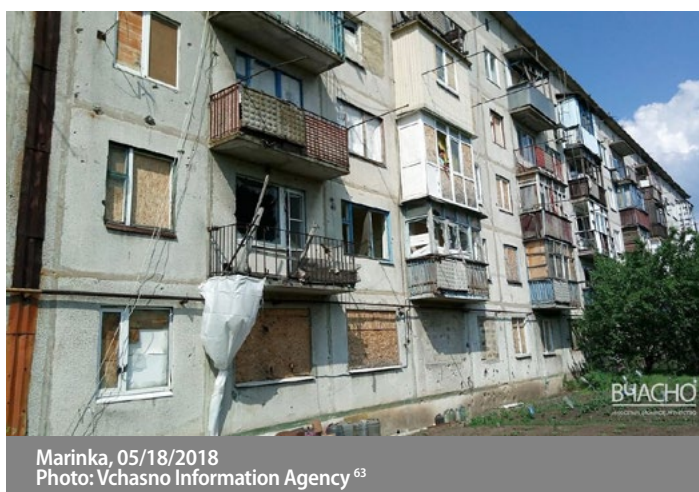
Marinka, 05/18/2018 63