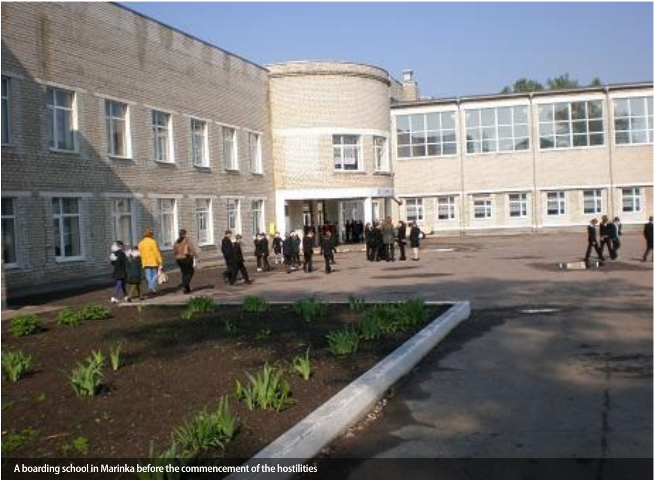
A boarding school in Marinka before the commencement of the hostilities

Shortly thereafter, notwithstanding the threats of the illegal armed groups, the local Donetsk authorities successfully arranged a safe evacuation of children outside the ATO zone. In late July, 34 boarders of Marinka boarding school were sent to Holubok health center in Sviatohirsk 26 .