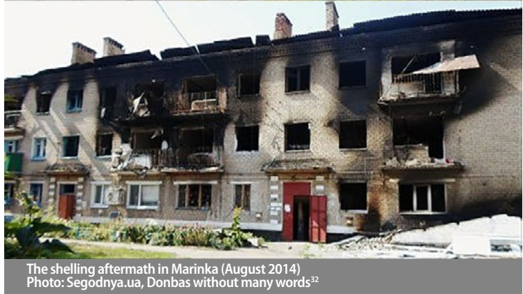
The shelling aftermath in Marinka (August 2014) Photo: Segodnya.ua, Donbas without many words 32